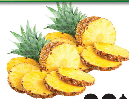
Sweet Pineapples Piña Dulce