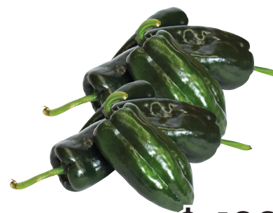
Pasilla Peppers Chile Pasilla