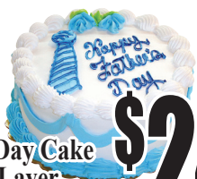
Father Day Cake Double Layer 8" Round