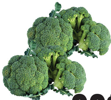
Fresh Broccoli Brocoli