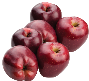
Red Delicious Apples Manzana Roja

Follow us on Instagram for EXCLUSIVE Instagram Specials Weekly!