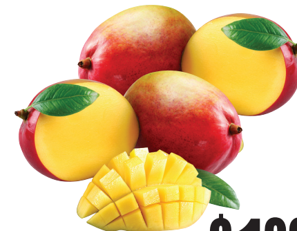
Sweet Mangos Mango Dulce