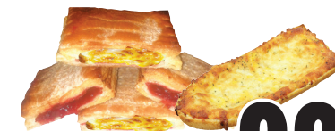
Guava & Cheese Strudel or Cuban Cheese Bread