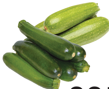
Mexican or Italian Squash Calabazita Mexicana o Italiana