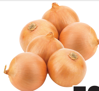
Brown Onions Cebolla Cafe